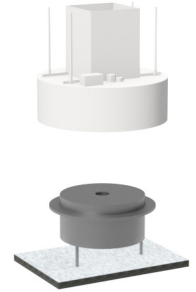
Model SSA-ISLE72R shown