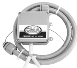
Low Chemical Alarm