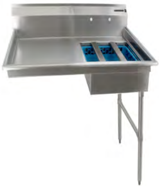
48" Undercounter dishtable with Pre-Rinse