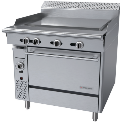
Model C36-19C Plancha with convection oven