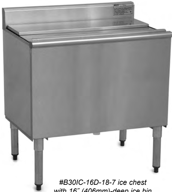
#B30IC-16D-18-7 ice chest with 16" (406mm)-deep ice bin

Eagle 1800 Series Ice Chests with Sealed-In Cold Plate, model _____ . Top, front, backsplash and ice bin to be heavy gauge type 304 stainless steel. Fabricated ice bin is fully insulated with 1½" drain, and sealed-in 7-circuit cold plate. 1½" O.D. galvanized tubular legs with adjustable bullet feet.