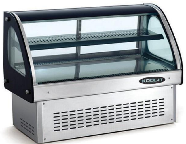
Attractively designed base allows display to be used either as a drop-in or as a freestanding countertop unit.