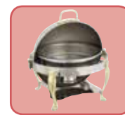
Open to 90°