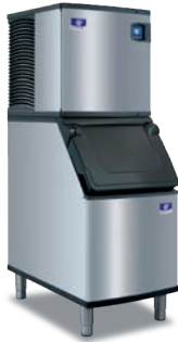
IT0420 D-320 Bin