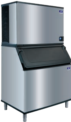
IT1900 D-970 Bin