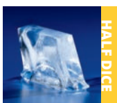
Available on all undercounters

These compact ice cube machines are ideal for small-volume ice production, for limited use needs, or as back-ups for larger machines. Specifically designed to fit beneath counters or in areas where floor space or height restrictions prohibit use of larger equipment. The petite size makes any of these models ideal for on-the-spot installations at coffee shops, stadium boxes, refreshment/break areas, or wherever limited ice needs require equipment with a small footprint.