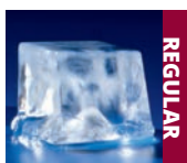
Available on UF0140 and UF0310