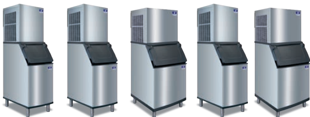
RNP0320 D-420 Bin