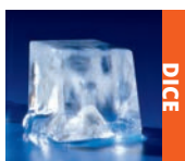
Available on all undercounters