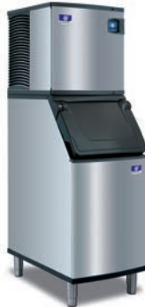
IT0620 D-420 Bin