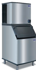
IT0900 D-570 Bin