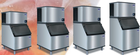
IT0300 D-400 Bin