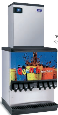
Ice/Beverage Series on Beverage Dispenser