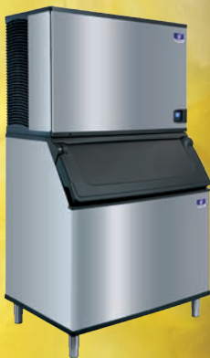
IT1500 D-970 Bin