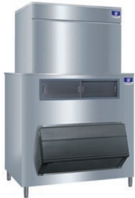
ST3000WH LB1760 Bin