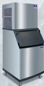
RFF1300 D-570 Bin