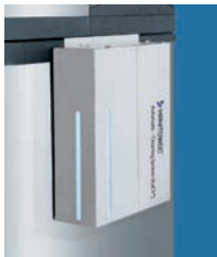
iAuCS (External Mounting)

iAuCS counts the number of ice-making cycles and, at a frequency you select, initiates a cleaning or sanitizing cycle... AUTOMATICALLY. Choose from 2-, 4-, or 12-week settings. Use with Indigo NXT modulators.