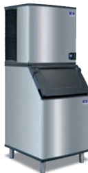
IT1200 D-570 Bin