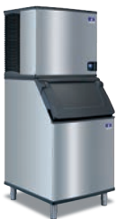
IF0900N D-570 Bin