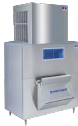
RFF2200C LB1760 Bin