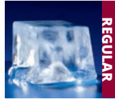
Available on iT0620