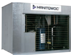
CVD Condensing Unit***