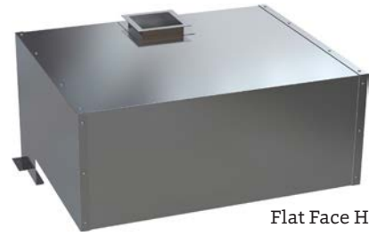
Flat Face Hood

The hood can be used in conjunction with one of Wood Stone's variable-speed exhaust fans (see previous page) to create an effective and responsive exhaust system. All duct work beyond the ventilator duct take-off collar is to be provided and installed by others in accordance with applicable codes.