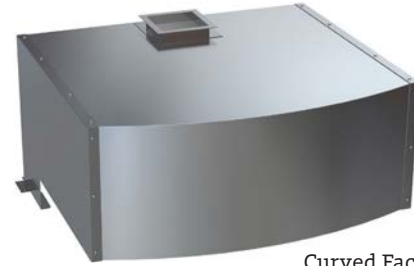
Curved Face Hood