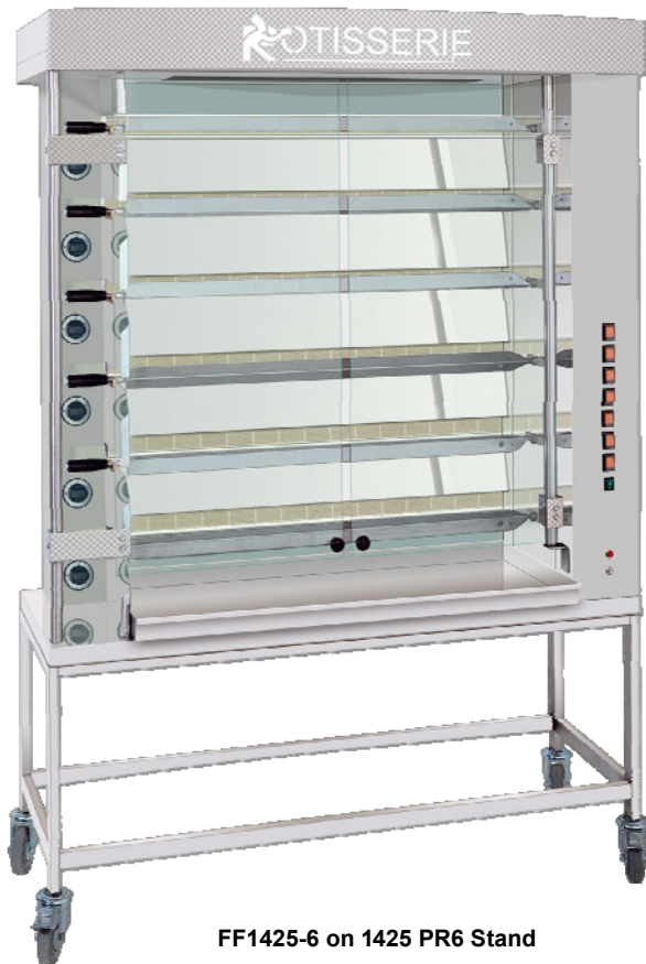
FF1425-6 on 1425 PR6 Stand

The FauxFlame is Rotisol's response to commercial needs for performance accompanied by light weight, minimal size, and mobility. FauxFlame rotisserie ovens offer rapid cooking and quality results with the attractive display and mouth-watering aromas that customers love to find in the marketplace.