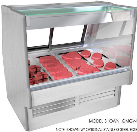
MODEL SHOWN: GMGV4

NOTE: SHOWN W/ OPTIONAL STAINLESS STEEL EXTERIOR