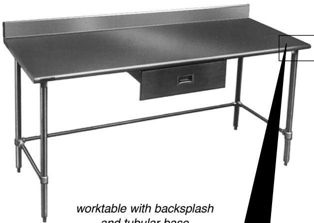
worktable with backsplash and tubular base —shown with optional drawer

Blendport worktables, Budget series, model _____. Top to be constructed of heavy gauge type 430 stainless steel with 1½" roll on front, 4½" backsplash, and sides turned down 90°. Open front with 1¼" O.D., stainless steel tubular crossbracing on sides and rear. Top reinforced with welded hat channels and sound deadened. Constructed with uni-lok® patented gusset system with the gussets recessed into the hat channels to reduce lateral movement. Legs to be 1½" O.D. stainless steel tubing, with stainless steel gussets and 1" stainless steel adjustable bullet feet.