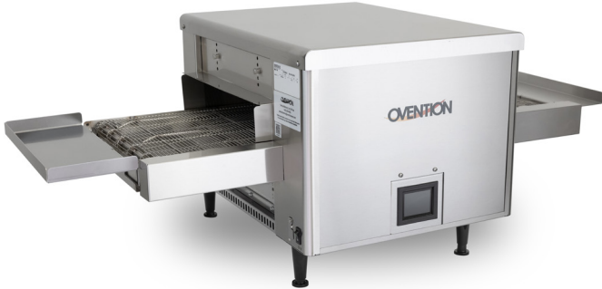
F1400 FINISHING OVEN