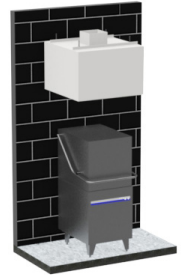
Model SSA-DISH42042 shown