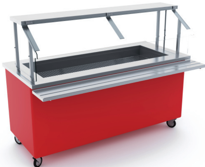
74-CFI-F shown with options: (A) Beaded, stainless steel tray slide and (M) buffet shield single service hinged protector.