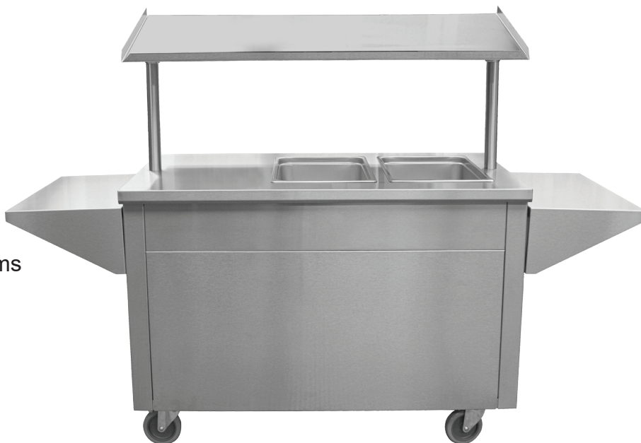
BST-46 EBC (Front)