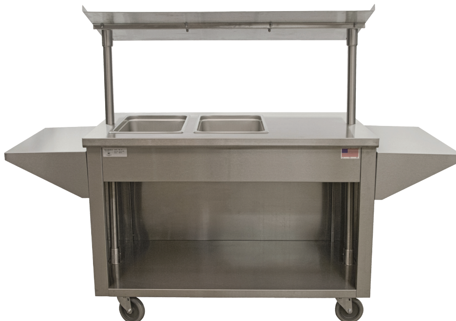
BST-46 EBC (Operator Side)

OPTIONAL MAGNETIC GRAPHICS: Multiple merchandising graphics available as an additional option. Ships separate from unit.