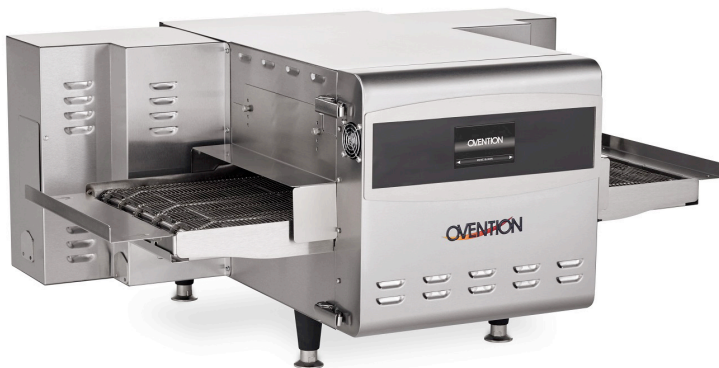
THE CONVEYOR C1400

† Ventless certification is for all food items except for foods classified as “fatty raw proteins”. Such foods include bone-in, skin-on chicken, raw hamburger meat, raw bacon, raw sausage, steaks, etc. If cooking these types of foods, consult local HVAC codes and authorities to ensure compliance with ventilation requirements. Ultimate ventless allowance is dependent upon AHJ approval, as some jurisdictions may not recognize the UL certification or application. If you have questions regarding ventless certifications or local codes, please email connect@ventionovens.com .