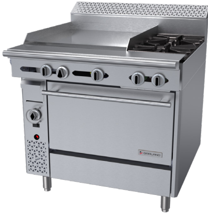
Model C36-2R Range with 36" Griddle Valve or Thermostat Controlled