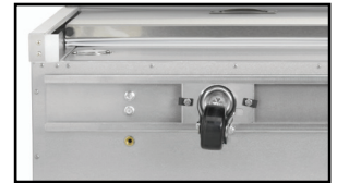
Enables durability & flexible positioning