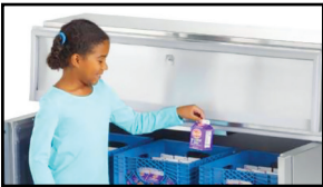
Ensures the smallest students can reach what they need