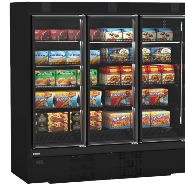
Optional black interior finish