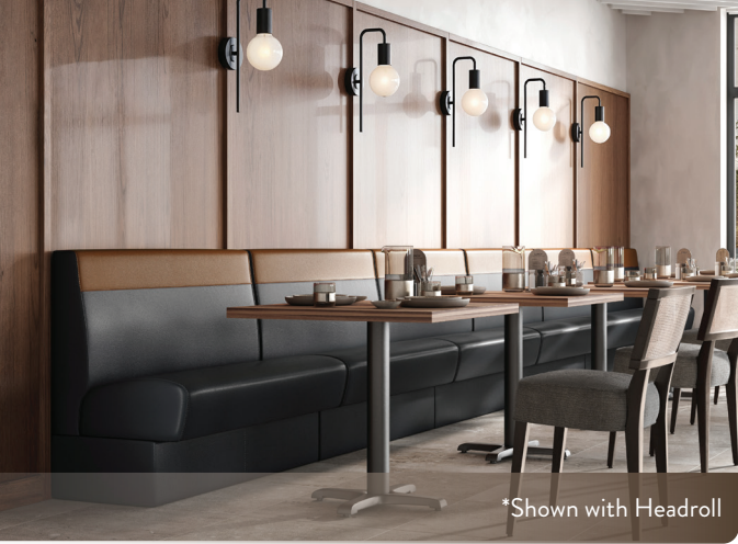
*Shown with Headroll