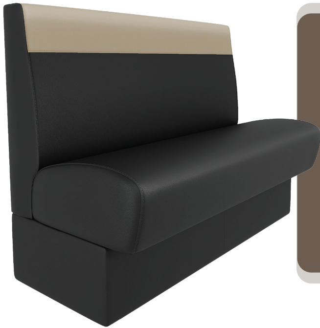
*Shown with Headroll

Every booth is handcrafted by a team of skilled, experience craftsmen who know what it takes to build seating that lasts – upholsterers who understand design and comfort, former restaurateurs who know what works in a busy dining area, and engineers who design frames to last.