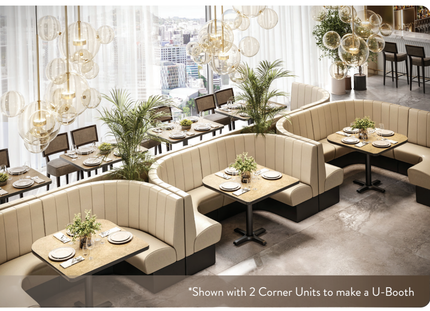
*Shown with 2 Corner Units to make a U-Booth