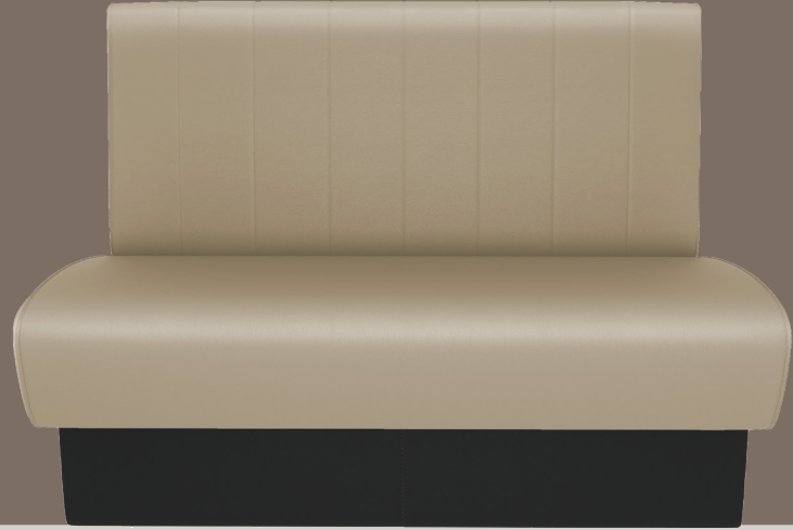
*Shown with Stitched Channeling

QA Group's modular Cascade Collection of restaurant booth seating is the best value in food service for high quality, commercial-grade furniture. Thoughtfully designed to enhance any dining space, our booths offer style, comfort and durability without breaking the bank. Our modular booths help you get the most out of your space, whether you need straight, double, or corner units. The result? A polished, efficient layout that looks as good as it functions. The sophisticated styling sets and careful construction set it apart from lower-quality alternatives and create a lasting impression on patrons. We offer two heights, three lengths, and a variety of vinyl colors and back designs so you can create a look that fits your brand perfectly!