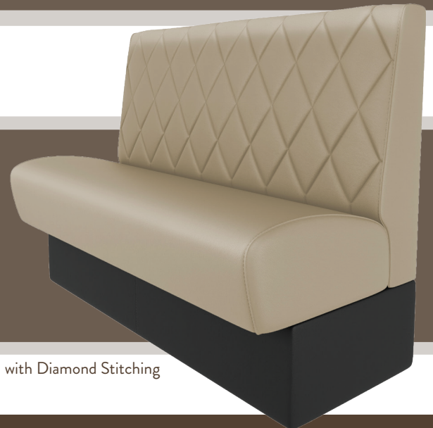
*Shown with Diamond Stitching

Upgrade your space with the Cascade Collection by QA Group. Built to last, designed to impress.