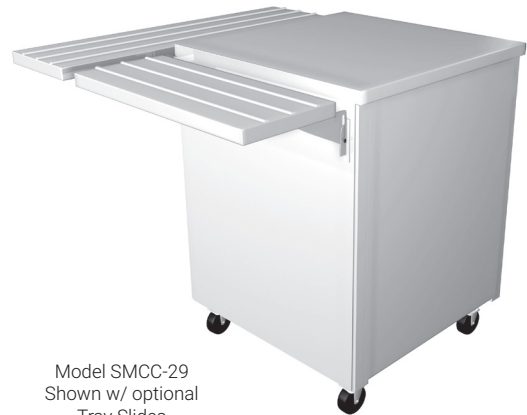
Model SMCC-29 Shown w/ optional Tray Slides