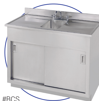
Model #BCS Shown w/ Optional Sink, Faucet & Backsplash