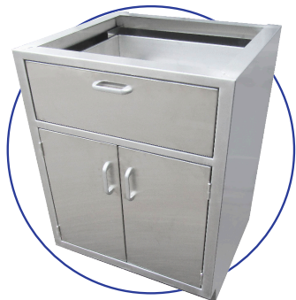
Model #BCH-2426 Shown w/o Countertop & Optional Drawer