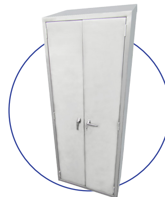
Model #SC-1830HS Shown w/ Solid Double Doors