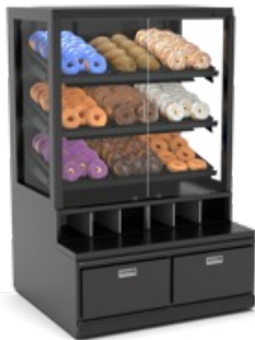
Shown with optional Package Ledge

Self-Service Freestanding Pastry Display