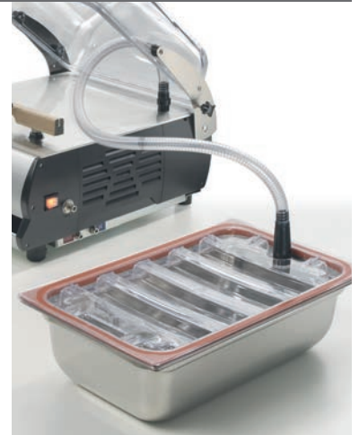
Reinforced Gastronorm Containers and Lids