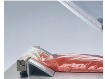
Standard support for vacuum bags with liquids