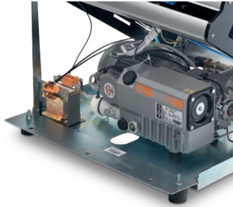
Easy access for oil change and service