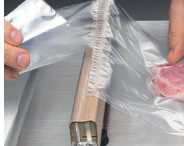
mod. W8 30 - 40 Optional Seal bar with Cut-Off Wire