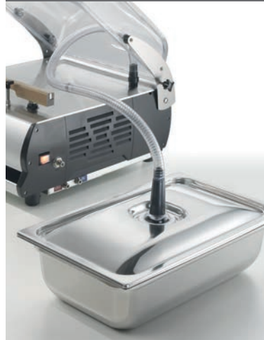
Reinforced Gastronorm Containers and s/steel Lids