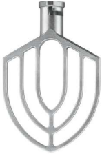
WSM20LMP Aluminum Mixing Paddle