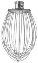
WSM20LW Stainless Steel Chef's Whisk