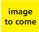
WSM20LBL 20-Quart Stainless Steel Bowl