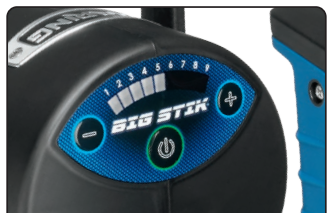
Electronic speed adjustment with LED indicator