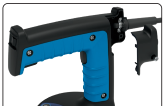
Dual-trigger handle and serviceable cord design