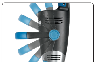
Patented pivoting second handle and comfort grip