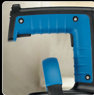
Ergonomic dual-trigger handles and rubberized comfort grip