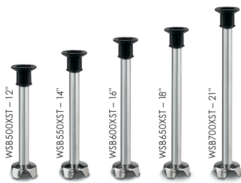
12-21" IMMERSION BLENDER STAINLESS STEEL SHAFTS WSB500XST, WSB550XST, WSB600XST, WSB650XST, WSB700XST