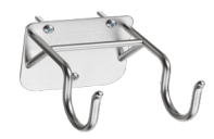
IMMERSION BLENDER WALL HANGER WSB01X