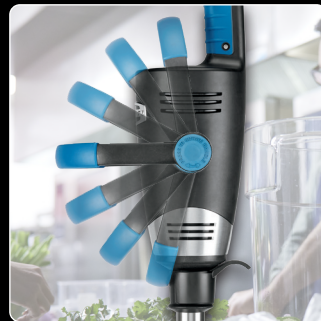
Patented pivoting second handle ensures comfort and control