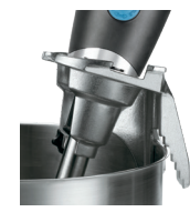
IMMERSION BLENDER BOWL CLAMP WSBBC