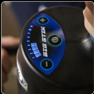
Powerful motor with digital controls for precise control

Take your blending experience to the next level of power. Designed for professionals, built for performance – Waring puts control in your hands.