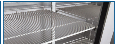
Electrostatically painted Shelves