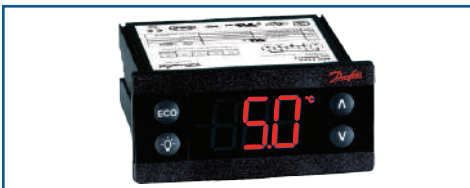
Digital Temperature Controller