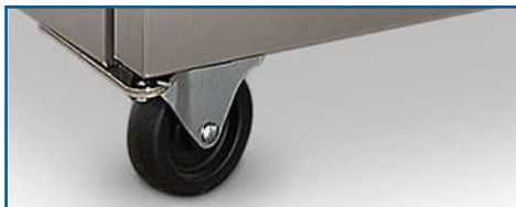
Heavy Duty Casters