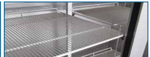
Electrostatically painted Shelves