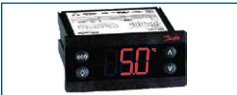
Digital Temperature Controller