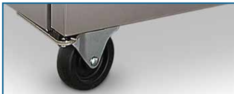
Heavy Duty Casters