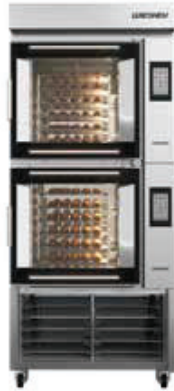
E3 S vario with base frame