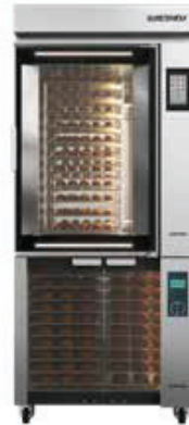
E3 L with prover or with base frame