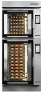
E3 SL with loading system