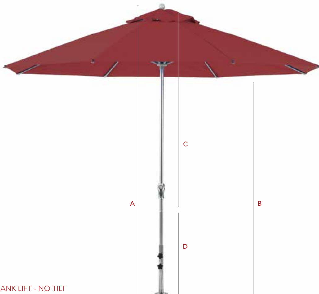
COMMERCIAL CRANK LIFT - NO TILT