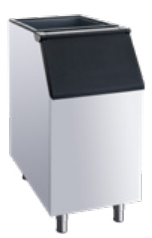
—D-350/550 (Ice Storage Bin)—