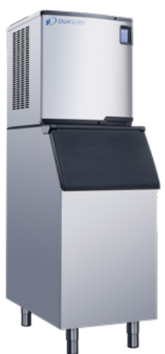
—DIM-500A / 700A—