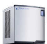
—AC-500/700 (Main Unit)—