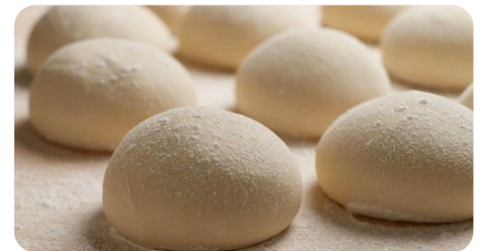
Up to 1200 balls / hour

1-year parts and labor warranty (US Only)