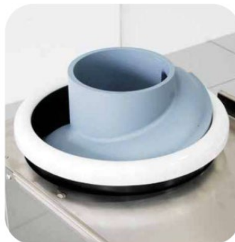
Central Spiral Teflon