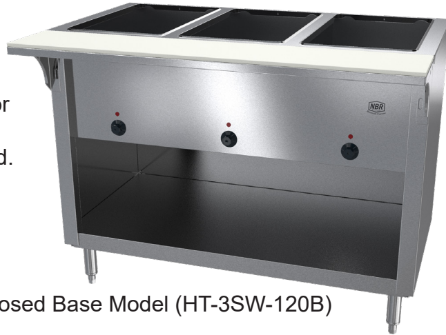
*Enclosed Base Model (HT-3SW-120B)