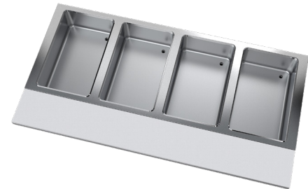
*Top view of HT-4SW-240(B)

Add an Overshelf & Casters to your Hot Food Counter! (See Pages 130)