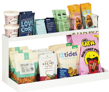
JUNO 2 TIER MERCHANDISER