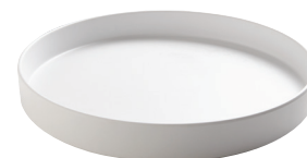
12" RAISED RIM PLATE