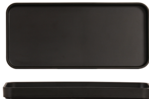
13 X 6" RECTANGULAR PLATTER Specify Color: Black (-13), White (-15), Stone Blue (-111). ITEM 22025-613 | 13Wx6Dx1H