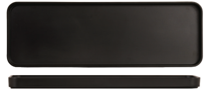
18 X 6" RECTANGULAR PLATTER Specify Color: Black (-13), White (-15), Stone Blue (-111). ITEM 22025-618 | 18Wx6Dx1H