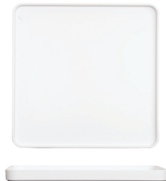
SQUARE LOW RIM PLATTERS Specify Color: Black (-13), White (-15). ITEM 22025-11 | 11Wx11Dx1H ITEM 22025-14 | 14Wx14Dx1H ITEM 22025-11CVR | 11Wx11Dx2½H | Cover For 11" Plate

Please visit www.calmil.com/legal for a complete list of California Proposition 65 related items.