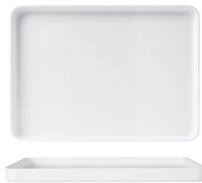
13 X 9.5" RECTANGULAR PLATTER Specify Color: Black (-13), White (-15). ITEM 22025-13 | 13Wx9½Dx1H