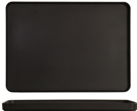
18 X 13" RECTANGULAR PLATTER Specify Color: Black (-13), White (-15), Stone Blue (-111). ITEM 22025-1813 | 18Wx13Dx1H