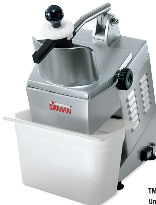
TM A Unit only, please choose plates