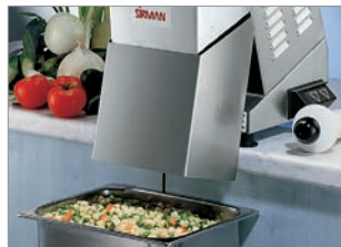
Chute for continuous product ejection, with safety microswitch.