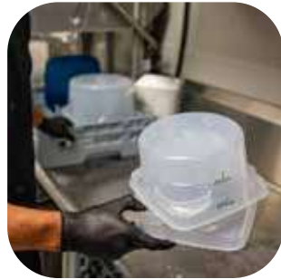
Cross stacking for sanitary drying