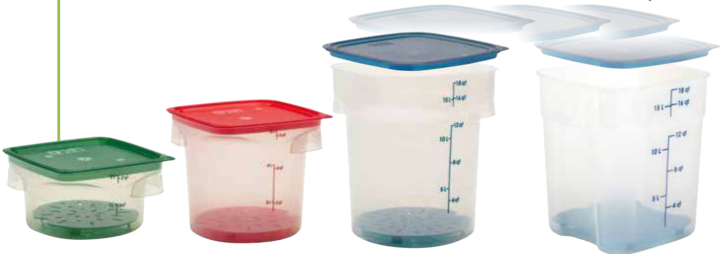
Color-coded matching seal covers, drain shelves, and graduation marks

Share the same seal covers as FreshPro CamSquares