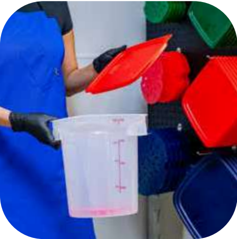
Peg holes on drain shelves and seal covers