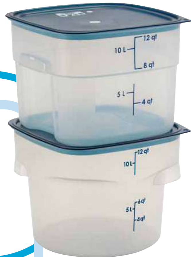
CamSquares® can stack on top of CamRounds™ for maximum space-saving storage