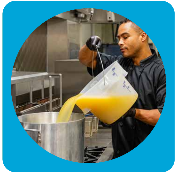
Curved corners for safe 4-sided pouring