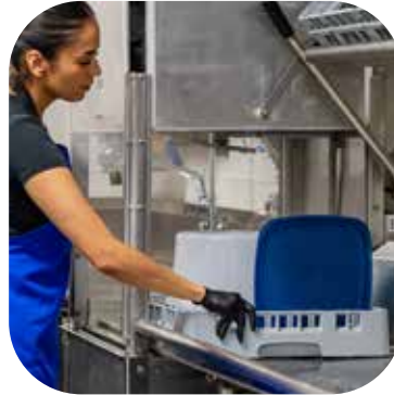
Commercial dishwasher safe