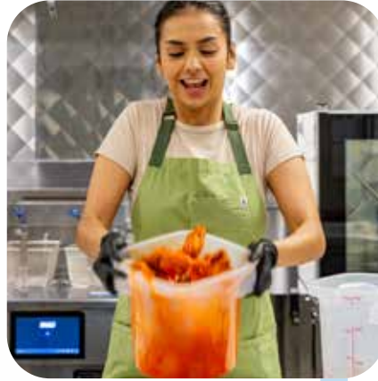
Easy to wing it