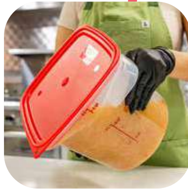
Spill-proof seal cover