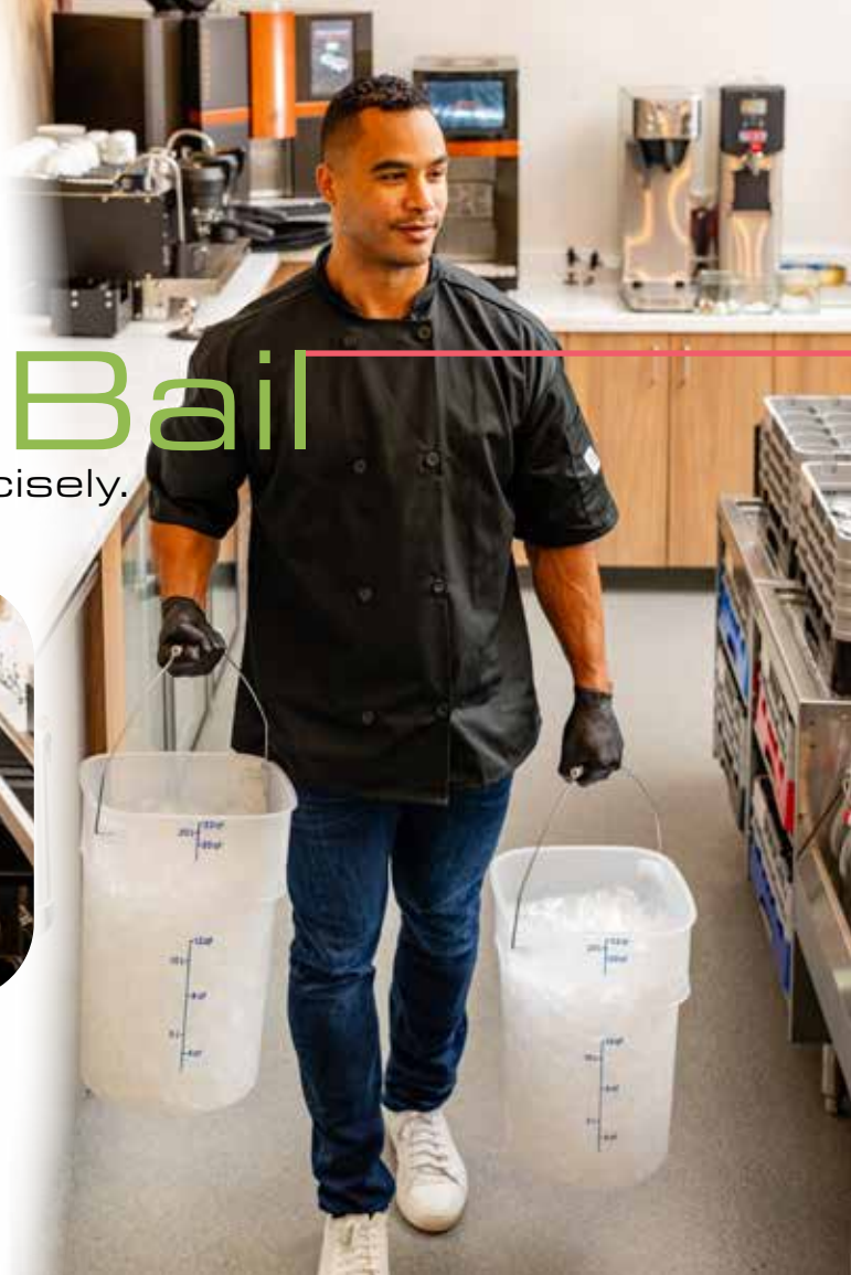
Heavy duty construction