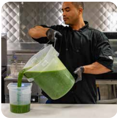
Precise pour control