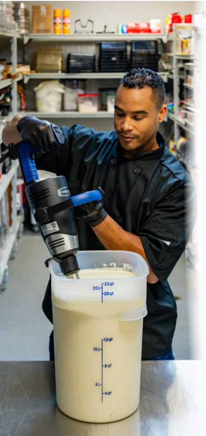
Perfect for immersion blenders