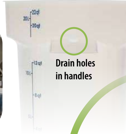
Drain holes in handles