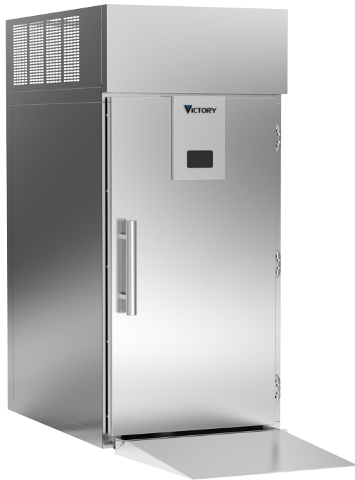
Note: Shown With Optional Ramp