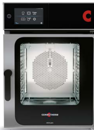
mini pro 6.10