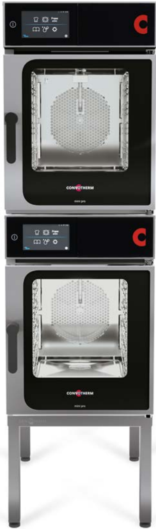
mini pro 6.10 + 6.10

The mini pro delivers unmatched versatility with the widest range of cooking modes, from frying to sous vide, making it a valuable replacement for multiple pieces of kitchen equipment.