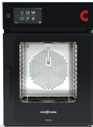
mini pro 6.06