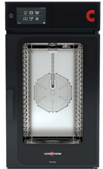
mini pro 10.10