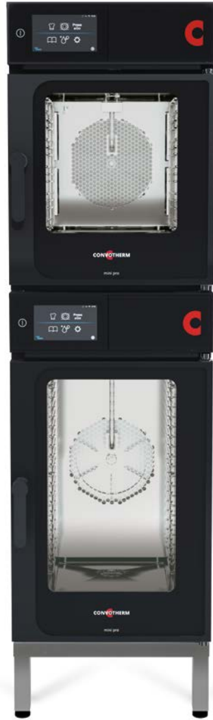
mini pro 6.10 + 10.10