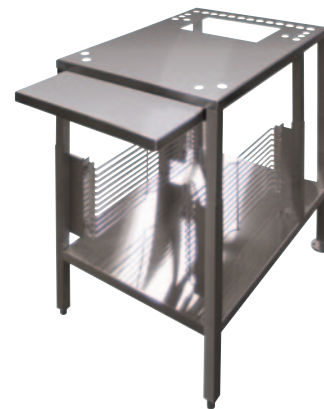
Equipment Stand model Unistand34 with POSK Pull Out Shelf and URK Pan Rack Kit