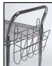
Document Holder see page 69