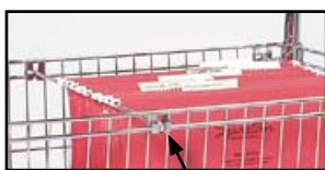
File Folder Dividers for Cart