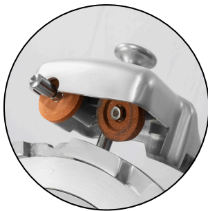
Integrated Balde Sharpeners