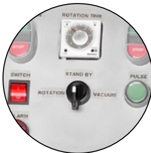
Standby Electric Features