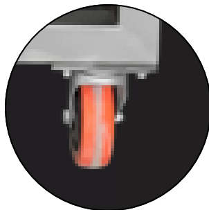
Casters for Easy Transportation