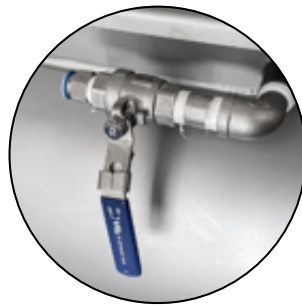
Connection Valve to Pump