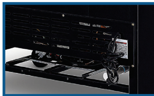
Easy access to compressor