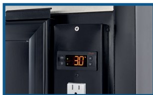
Electronic digital controller