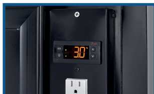
Electronic digital controller