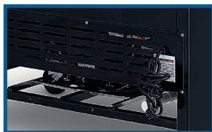
Easy access to compressor