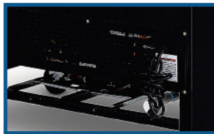
Easy access to compressor