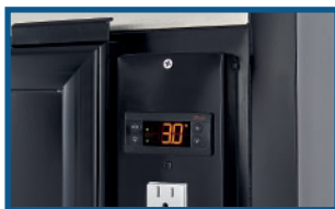
Electronic digital controller