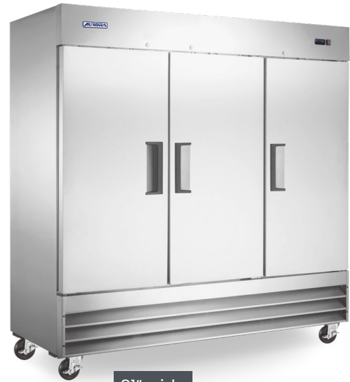
81" wide 59028