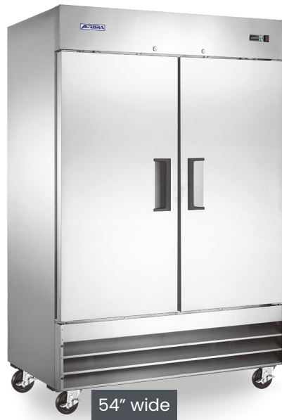
54" wide 59026