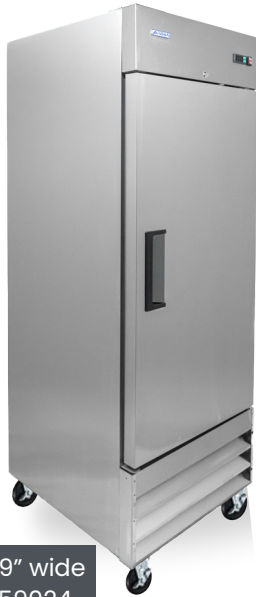
29" wide 59024