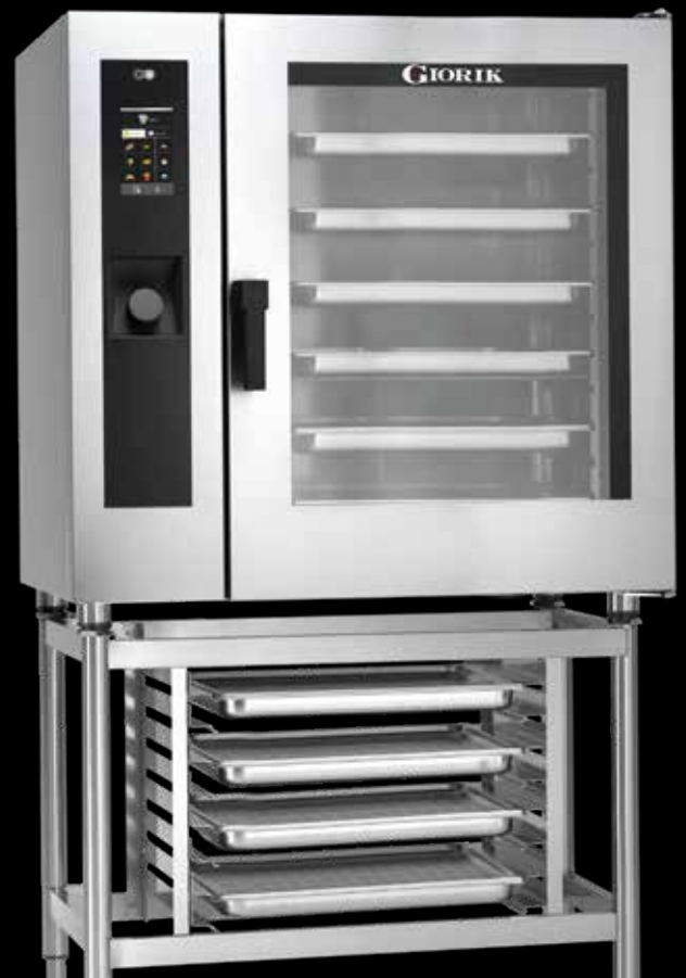
10 GN 2/1 10 Full Sheet Pans (18" x 26") or 20 Half Sheet Pans (13" x 18")