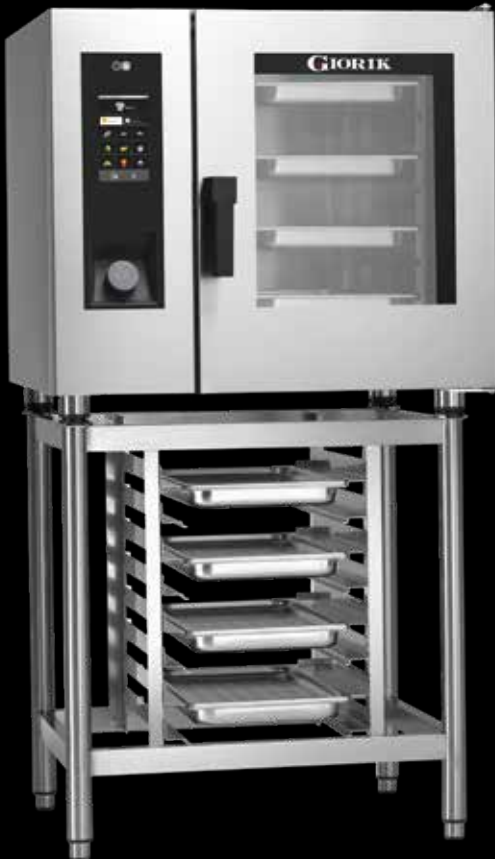
6 GN 1/1 6 Half Sheet Pans (13" x 18")