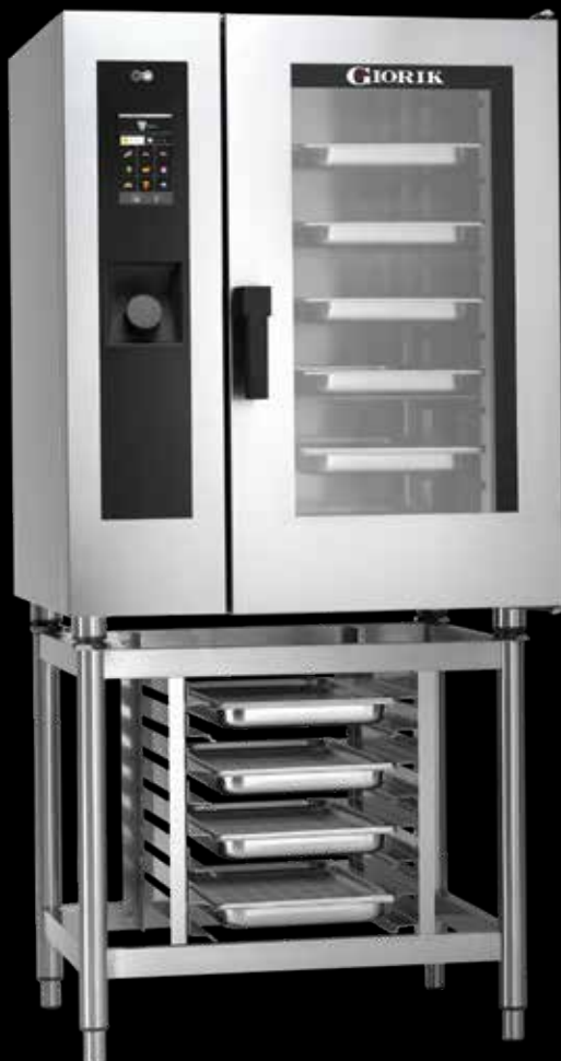
10 GN 1/1 10 Half Sheet Pans (13" x 18")