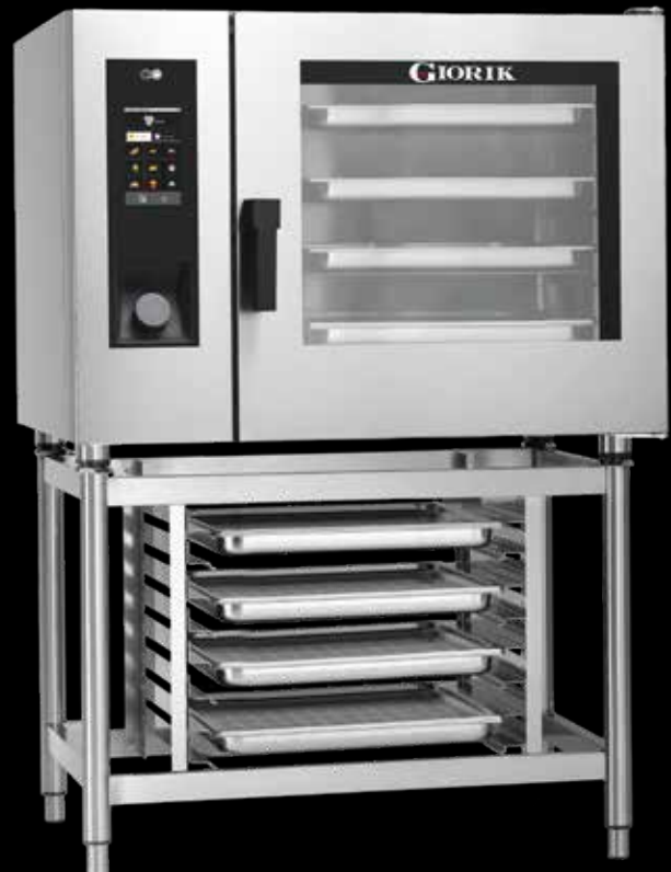
6 GN 2/1 6 Full Sheet Pans (18" x 26") or 12 Half Sheet Pans (13" x 18")