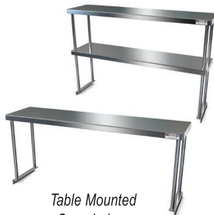
Table Mounted Overshelves