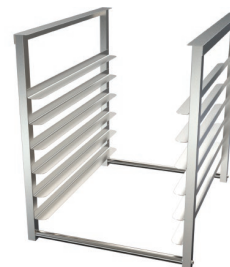
Table Mounted Bun Pan rack