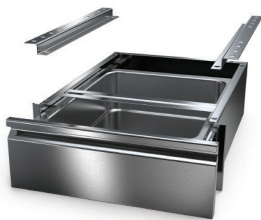
Self-Closing Table Drawers

Add Worktable Accessories! See pages 42 - 46 & 57 - 58.