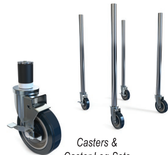
Casters & Caster Leg Sets